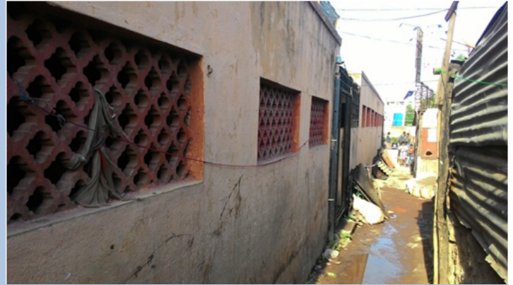
Community toilet situated at the entrance of Sanjay Park slum

footpath besides the road. The problem was further compounded as the slum did not have a garbage collection system in place resulting in choked sewerage lines. This created a health nuisance to the entire neighbourhood which has been 'up in arms' against the community.