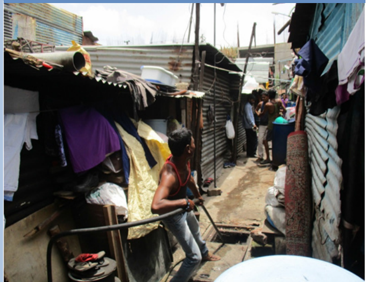
Cleaning of drainage lines with the help of the ward office

The physical changes are very visible as the lanes have neatly lined up pucca houses which are almost two storey in height reflecting the aspirations and upward mobility of the community.