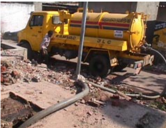
PMC sullage vans can only suck out the liquids

It seemed at first that the only way to clean out the tanks was by getting safai kamgars to do the job.