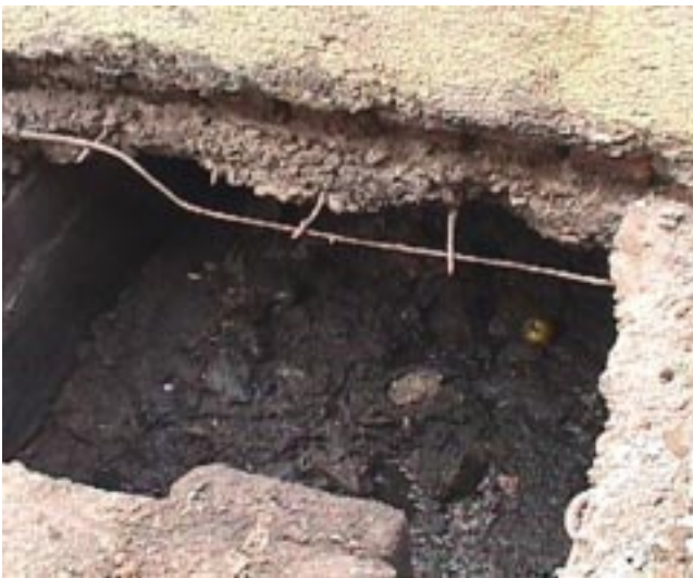
That's an old aqua-privy after the superstructure has been removed. This is what the safai kamgars had to deal with.

Traditionally, the people employed to deal with sewage are bhangis or safai kamgars (who are dalits, but often looked down on by other dalits). These were the people who would collect the nightsoil in the villages, and carry it away on their heads to dispose of it. This practice continues in many areas today.